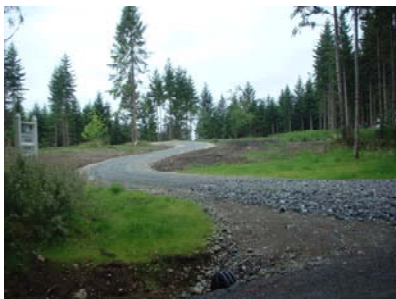
Right & Left Great examples of curvilinear driveways.