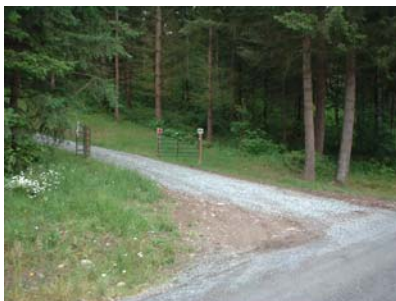
Right & Left These driveways will allow rain water to run into the adjacent roadway rather than the ditch line