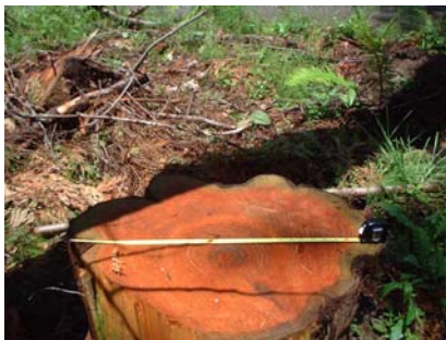
2'+ illegally cut tree within easement